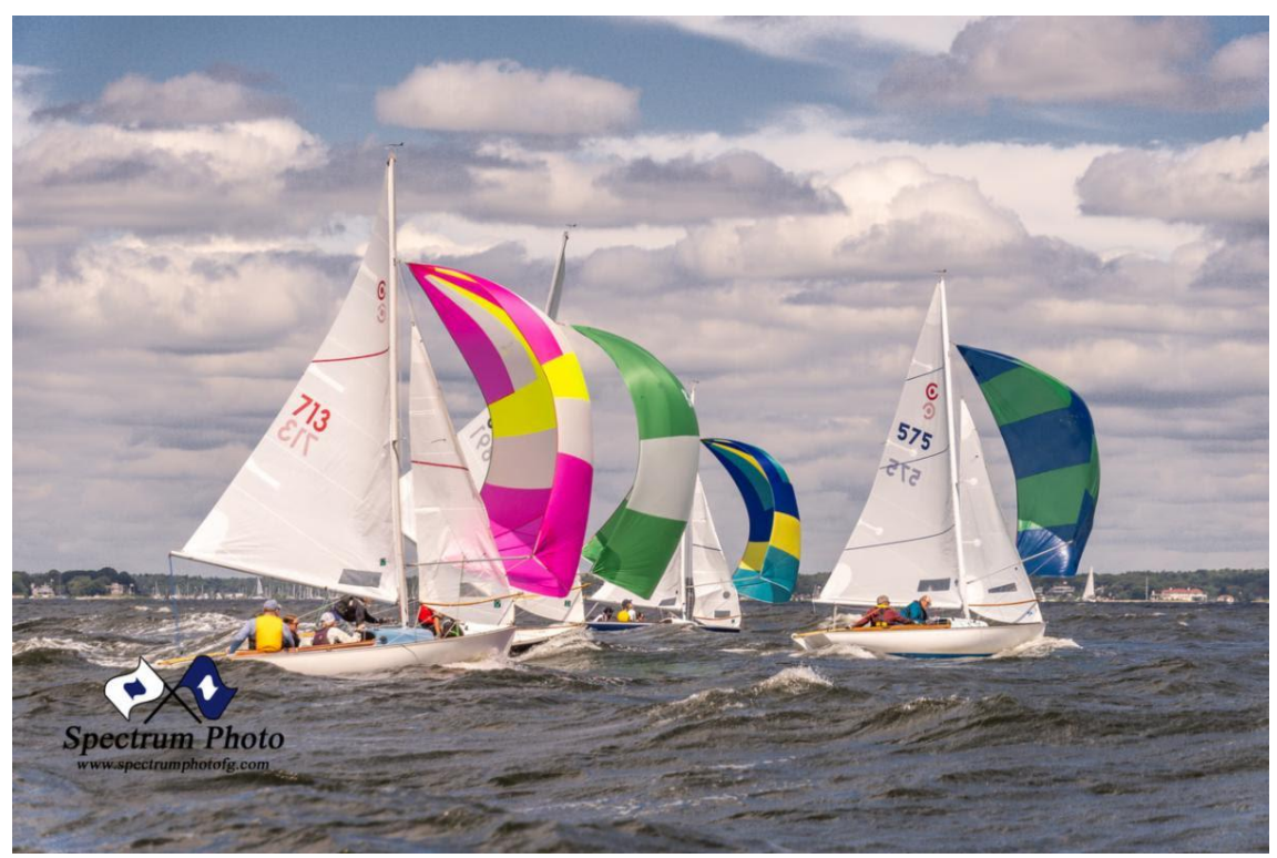
Click for Photos: Bullseye Nationals 2023, Beverly YC