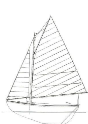
HERRESHOFF BULL'S EYE