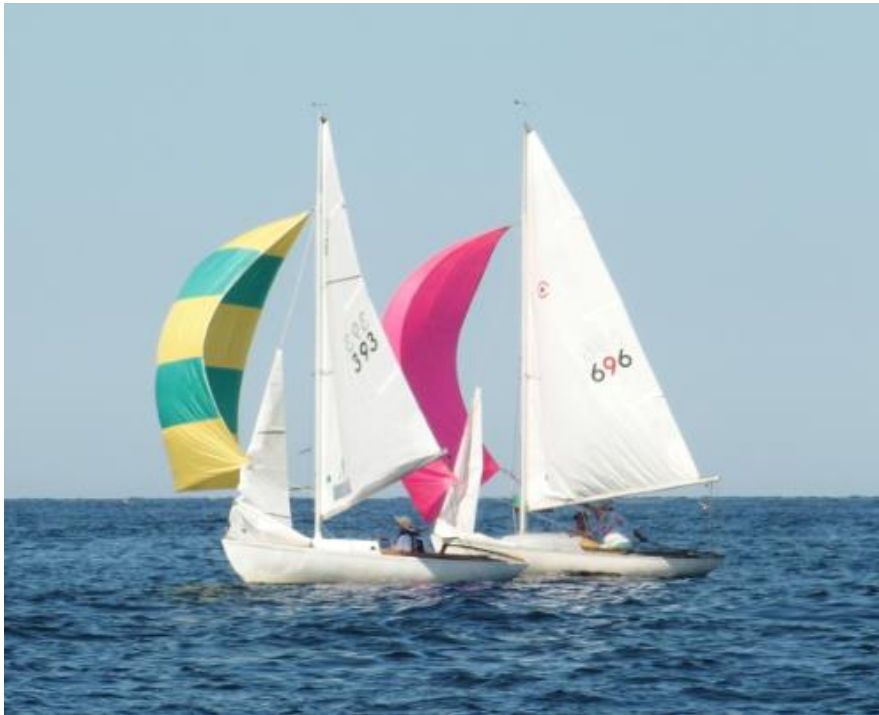
Photo from 2021 Bullseye Nationals Photos, Bullseye Sailing Assn