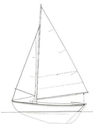
FISHER'S ISLAND SOUND BULL'S EYE